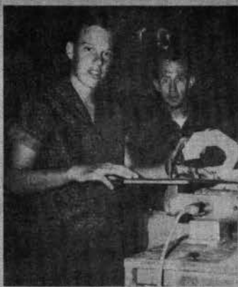
WORK FOR COMMUNITY. Members of the delegation are seen here at a meeting.

The center is currently seeking volunteers to help with its programs, and would appreciate any help that can be provided.